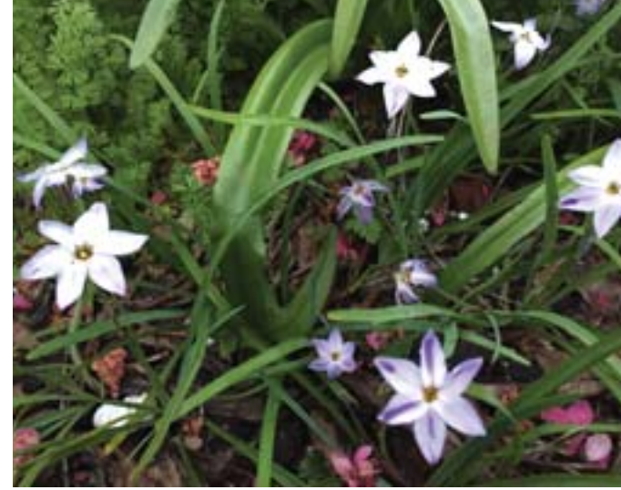
Blue star grass amidst the fallen petals of peach blossoms.